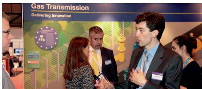
Engaging with our stakeholders at an innovation conference in 2014

Engaging a broad and inclusive range of stakeholders – we have taken the time to understand our stakeholder groups and how we can focus on their needs. Reflecting on our progress has helped us to find opportunities for collaboration and best practice around our stakeholder priorities. We will compile more useful information that will help us to make more informed decisions. We want to continue to improve and better understand our individual stakeholders, as well as analyse our approach to segmentation more effectively. This will give us a clearer understanding of the relationships we have. We can then engage with stakeholders in a more considered way.