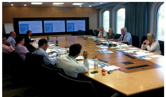
Our independent Stakeholder Advisory Panel reviewing our stakeholder engagement strategy in July 2014